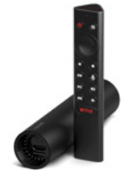
Nvidia Shield TV