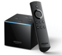
Amazon Fire TV